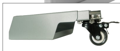
Optional casters ensures easy mobility